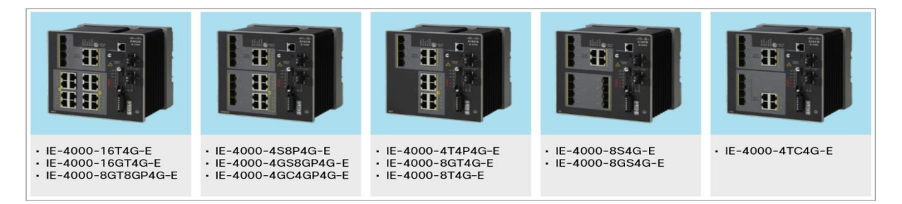
Table 2. Cisco IE 4000 Series Switches